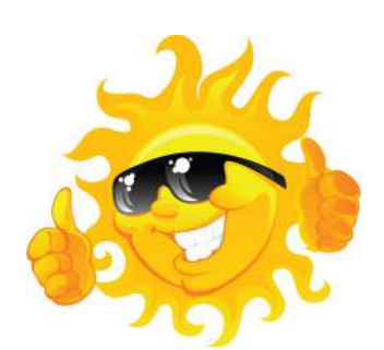
<u>We just want to thank</u> you for brining your child in before 9am!

Parents can have the night out while your child has a fun filled evening of arts, games, and a movie. We also provide dinner. Siblings and friend's children welcome. Please sign up at the front desk.