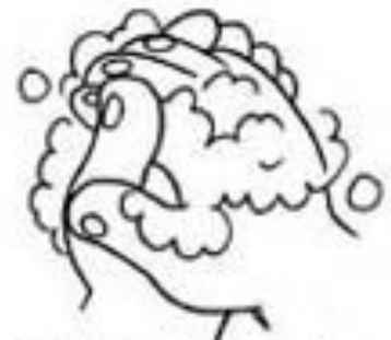
3. Scrub backs of hands, wrists, between fingers, under fingernails.