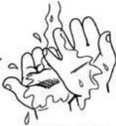
1. Wet hands