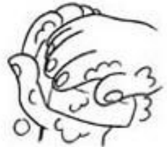
2. Soap (20 seconds)