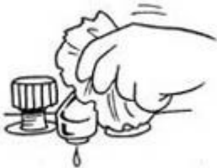
6. Turn off taps with towel