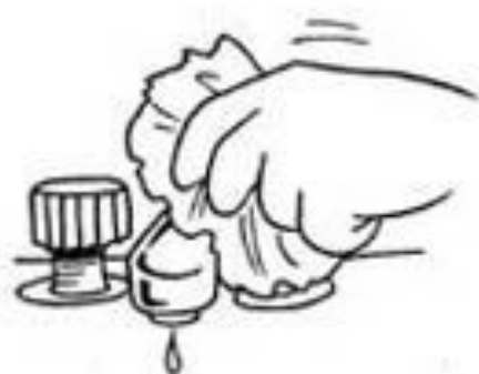
6. Turn off taps with towel