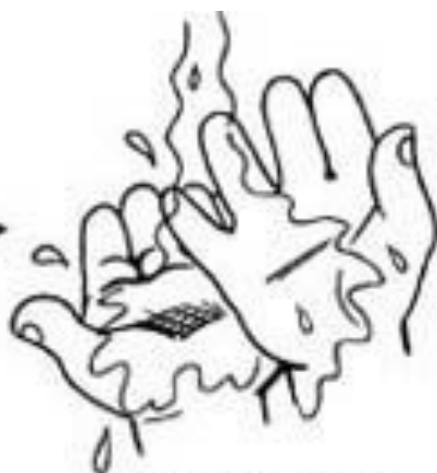
1. Wet hands