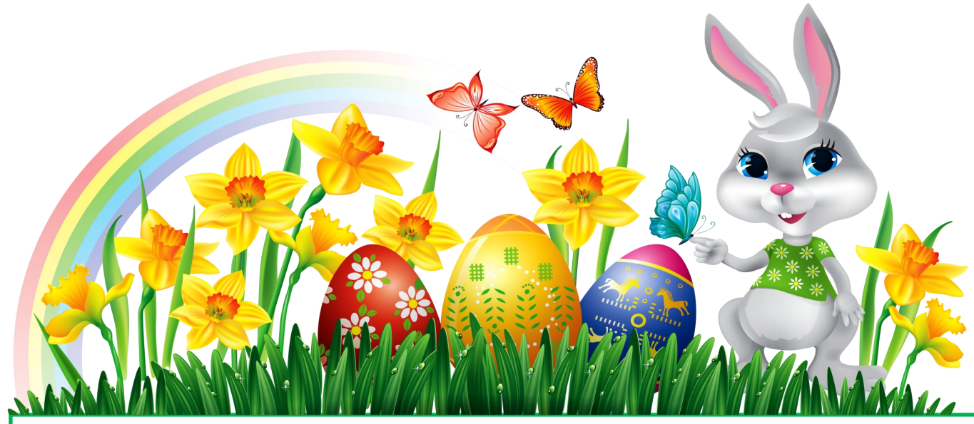
**VPK E & G**

This month we will be learning about animals in action, the sounds they make and how they move, we will slither like snakes, flutter like butterflies and waddle like ducks. We will be doing some fun Easter activities the week of the 14th. We will learn the letters Pp -Zz, number 20, colors brown and grey, and our shapes are triangle and rectangle. There is no school on April 18th and 21st. Spring Pictures along with Cap & Gown Pics are scheduled for May 8th.